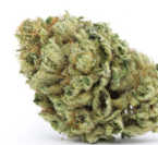
Cannabis flower today