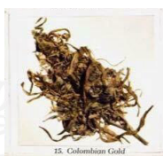
Cannabis Flower from High Times Top Strains 1977

THC content of confiscated cannabis flowers in recent decades (EISOhly et al., 2016)